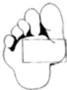
CHUSOKU Ball of the foot